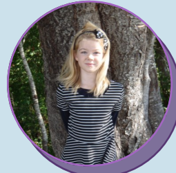
Sitka Vicha 1/15